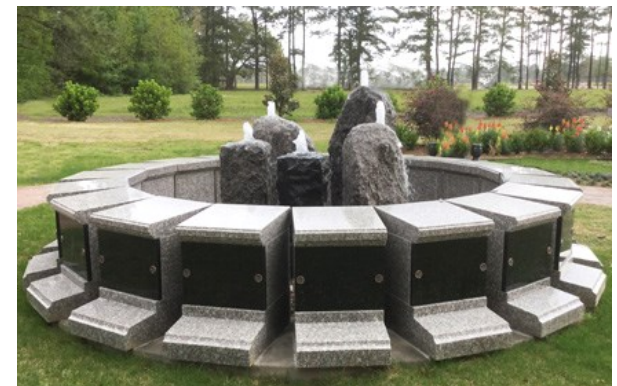
Fountain Estate $7,500