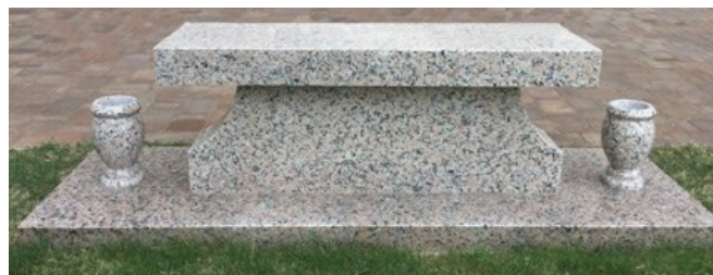
Cremation Bench $10,950