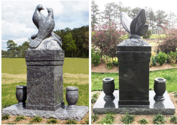
Private Pedestal—Tall $12,500