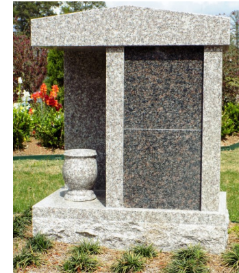
Fountain Estate $7,500