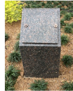
Individual Pillar $2,195