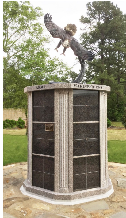
Veterans Columbarium Niche $1,800