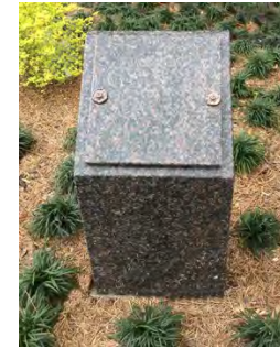
Individual Pillar $2,195