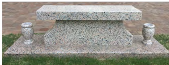
Cremation Bench $10,950