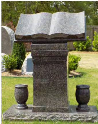
Private Pedestal—Short $10,950