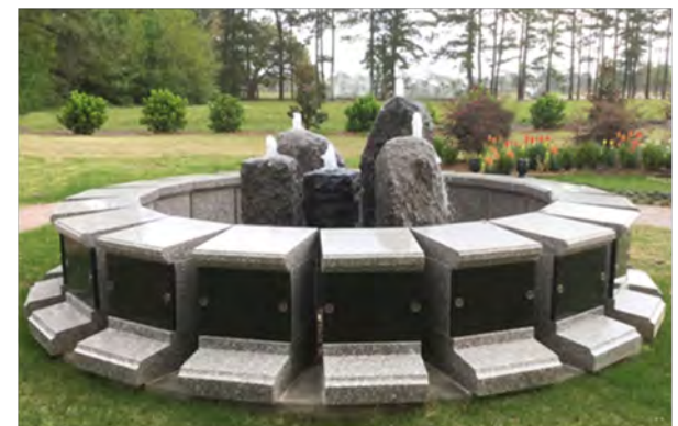
Fountain Estate $7,500