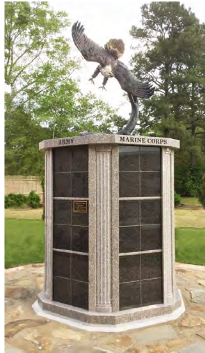
Veterans Columbarium Niche $1,800