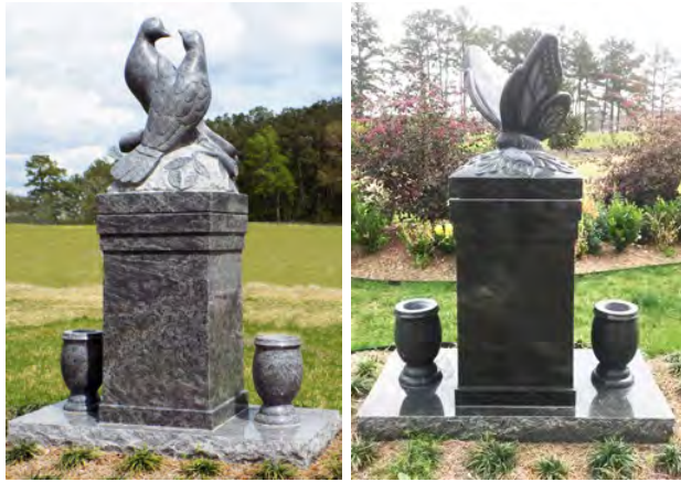
Private Pedestal—Tall $12,500