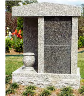
Companion Estate $14,500